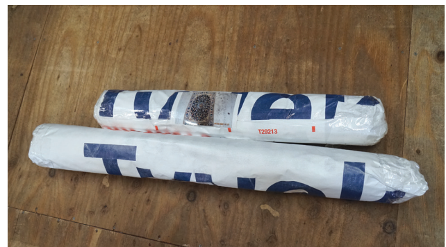
Rugs Wrapped for Storage